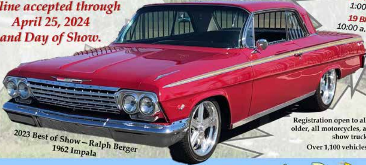
2023 Best of Show – Ralph Berger 1962 Impala

19 Block Cruising 10:00 a.m. - 1:00 p.m.